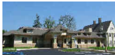
Visit the Ocean Township Branch of the Monmouth County Library at the MLA open house on March 29, 2007.

Our Annual Open House will be held at the new Ocean Township Branch of the Monmouth County Library on Thursday March 29, 2007 at 2:30-4:30 p.m. The Library is located at 701 Deal Road, Ocean, NJ (732-531-5092.)